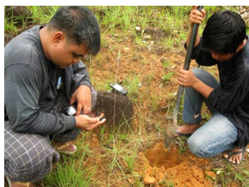
The image above features the watershed characterization conducted at Region III, Nueva Ecija for facilitating comprehensive site development.